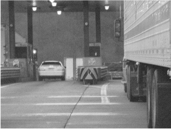
Figure 3 Toll Booth on the West Virginia Turnpike: Most of the turnpikes in the U.S. were constructed by state governments prior to the start of the Interstate Highway Program. Tolls cover the interest and redemption costs related to the bonds sold to finance the roads and also cover the costs of maintenance and operations. Tolls can also be used to manage congestion, by charging higher rates at peak hours or by charging higher rates for an express lane. Some states have considered privatizing their toll roads as a means of capturing the value of their investments, either to finance future transport system improvements or to reduce their states' indebtedness.

Various options could be used in a PPP. One common approach is for the public agency to seek bids in which the key variables would include a) the design of the bridge, b) the tolls to be charged and c) the length of time over which the private company would operate the bridge. The bridge would be owned (or eventually be owned) by the public agency, but it would be operated for an extensive period before it was turned over to the public agency. The public role could be to retain control over the size, design, and location, and purpose of the bridge; to ensure that the tolls are reasonable; to provide some financial security for the private company by providing some sort of minimum annual payment if traffic volumes do not rise as expected; or to provide assurance that a competitive project would not be built within some specified period of time.