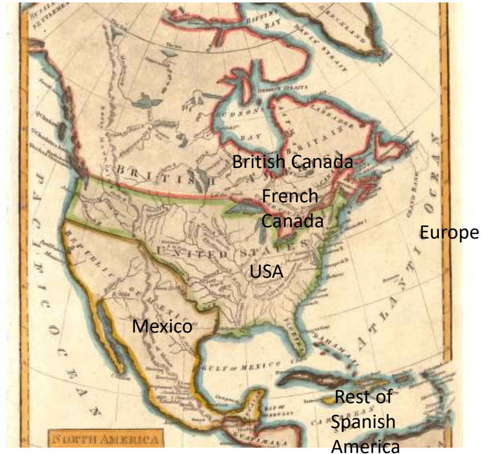
© Source unknown. All rights reserved. This content is excluded from our Creative Commons license. For more information, see https://ocw.mit.edu/help/faq-fair-use/ .