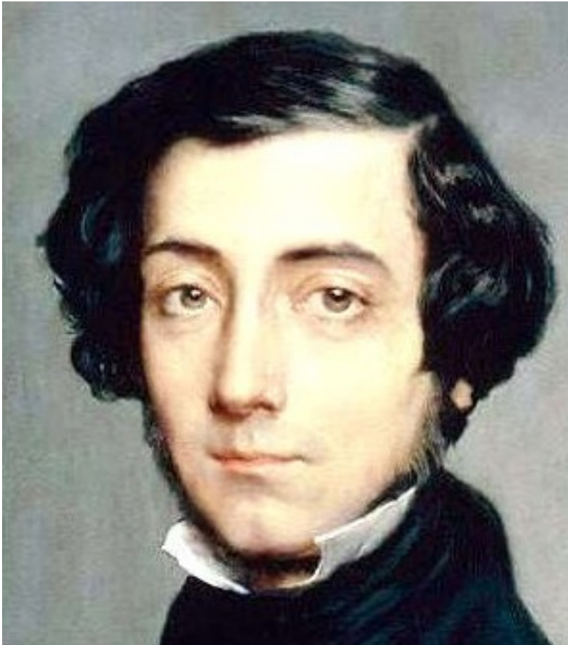
This image is in the public domain.